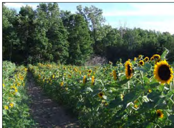
They also sell fresh cut flowers, like these sunflowers, throughout the summer.

Being a member of MIFMA allows us to network with other markets sellers from around the state. This gives us educational information on farming and selling techniques from other in the same kind of business.