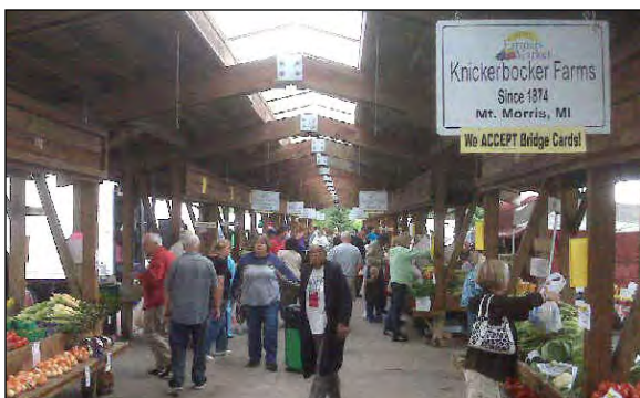
Flint Farmers Market RMA, August 27

The Michigan Farmers Market Association advances farmers markets to create a thriving marketplace for local food and farm products. Our vision is to place farmers markets at the forefront of the local food movement and to ensure all residents have access to healthy, locally grown food and that Michigan farmers markets receive policy support.