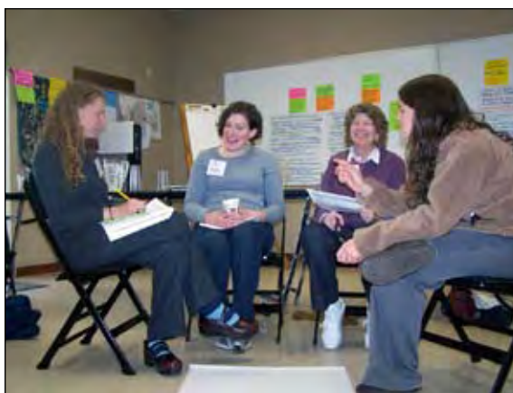
Retreat participants brainstorm about the purpose and future goals of the Partnership.

Specific goals of the retreat included sharing accomplishments and opportunities related to increasing farmers market access to low-income households; laying the foundation for strong working relationships through face-to-face networking and planning; identifying resources and connections available to the Partnership; reviewing 2009 project tasks and timeline to ensure successful completion and opportunity for partner engagement; and beginning long-term planning by